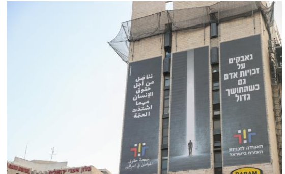
"Even in Darkness, We Struggle for Human Rights" Billboard Across from HCJ Following 2022 Elections

During this reporting period, ACRI's work was directly impacted by the absence of a stable government, the election period, and national and religious holidays during which the Israeli parliament and the High Court of Justice (HCJ) are closed. Nevertheless, in 2022, ACRI continued over 20 legal proceedings and 18 legal petitions.